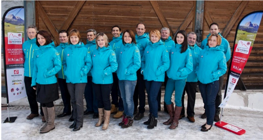
The 2013 IVV Olympiad Organizing Team